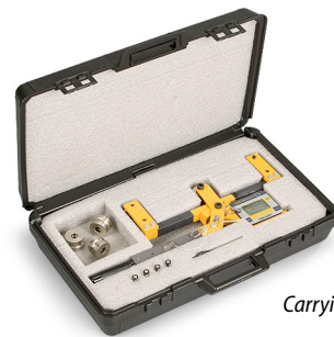
Carrying case included

Common calibration period is 24 months but should be more frequent in heavy use applications. Factory calibrations typically completed in 2 to 4 days. On site calibration may be possible through your Dillon distributor.